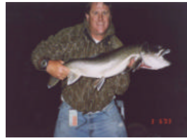
6 lb. largemouth, Colorado 10 lb. Mackinaw, Gold Lake Plumas County, 2003