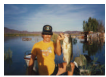
River, Walters Camp, 1988